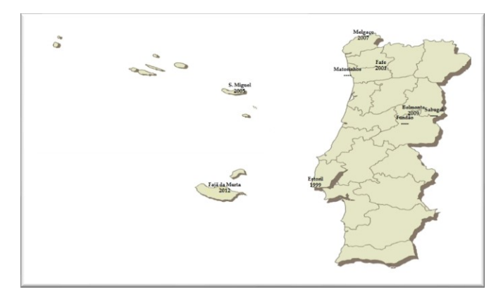
Portuguese Migration - Museological Initiatives

As a matter of fact, in spite of the existence of various initiatives of exhibitions that have dealt with this subject, a qualitative leap to convert the circumstantial into structural is essential, because many initiatives are, despite their great quality, ephemeral and should have a more permanent character. Accordingly, to understand the extent of the migratory phenomenon and its manifestations, it is important to locate and to be able to access a vast amount of documents, which became scattered over the decades in distinct governmental entities, police and administrative departments and many other private archives. Thus, it is imperative to digitalize and classify the gathered information, so as to give continuity to the archive in development, and lastly, make it accessible to current and future generations.