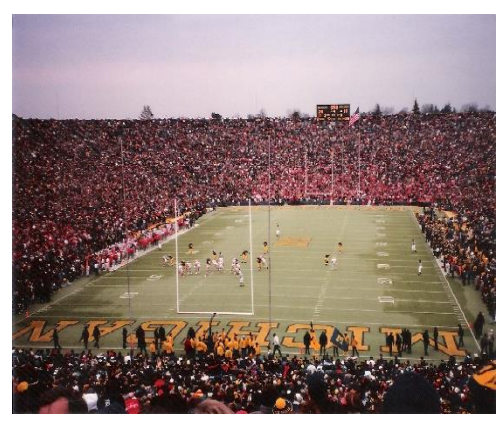
Two views of two different games at the University of Michigan Stadium – see how the Stadium is completely full! We can almost hear the outcry "Go Blue"!

The Stadium itself is like a monument in Ann Arbor, and the ambience in those games is something special! You just have to get there and hear, feel and shout the outcry "Go Blue!". If you have never experienced it, you have no idea what you miss!