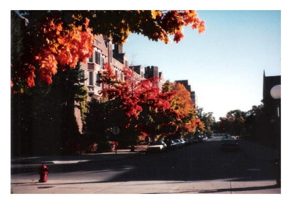
Autumn colors in Ann Arbor

(in counterclockwise direction) 1- Central Campus, near the base of Burton Memorial Tower; 2- Central Campus; 3- downtown Ann Arbor