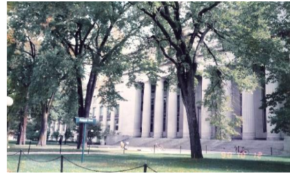
University of Michigan – Central Campus (from top to bottom and left to right) 1- Burton Memorial Tower; 2- The Horace H. Rackham building; 3- Angel Hall; 4- The School of Public Health

(photos 1, 2 and 3 by the author; photo 4 from https://www.publichealth.com.ng)