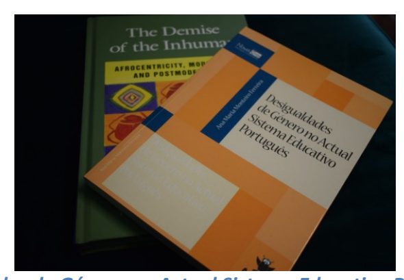
Figure 2- Desigualdades de Género no Actual Sistema Educativo Português : Sua Influência no Mercado de Emprego, Coimbra : Quarteto, 2002

Along her career, she was fighting for a new epistemological framework that would enable a more "human humanity", as she said, and against the persistent problem of Colorism, as is evident in many of her works, which were published in Portugal, Brazil, and the USA.